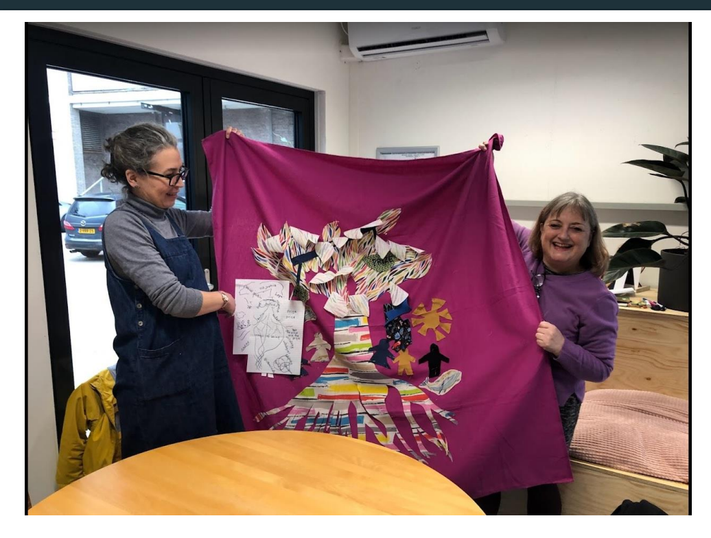
Experimenting with TrEE Decolonizing Education Amstedam, Feb. 2023